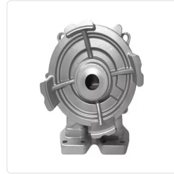
Precision Investment Casting 304 316 Stainless Steel... Pump and Valve Parts