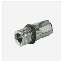
Expansion Shell Resin Roof Bolts Mechanical Roof Bolt for Bolt Anchor System