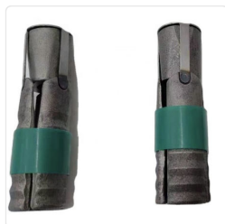
Underground Mining Expansion Shell Anchor