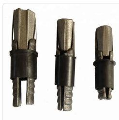
Expansion Shell Anchor Expansion Shell Rock Bolts