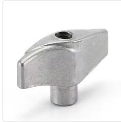
Stainless Steel Precision Investment Casting Farm Machinery Parts