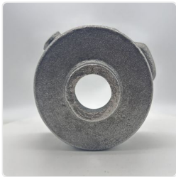
Gray Iron Sand Castings for Valves & Pumps Parts