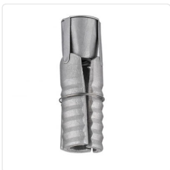
Tunnel and Mining Expansion Shell Anchor Bolt Expansion Shell Rock Bolt