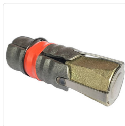
Mining Roof Bolts Roof Bolts For Resin Anchoring