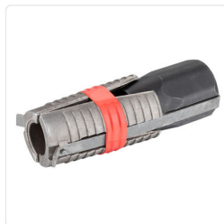
Expansion Shell Anchor Bolt Rock Support Bolt Mechanical Rock Support Bolt