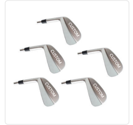
Lost Wax Casting 304 316 Stainless Steel Investment Casting Golf Head