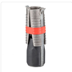
Expansion Shell Rock Bolt Anchors Tunnel Rock Bolt