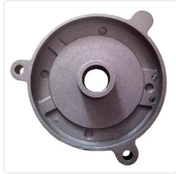
Cast Steel Engine Block for Auto Spare Parts