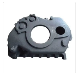
Ductile Cast Iron ASTM A536 65-45-12 Gear Housing