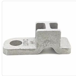
Cast Steel Railroad Accessories and Machine Parts Casting