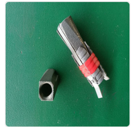
Rock Anchor Bolt Dywidag Expansion Shell DSI Expansion Anchor