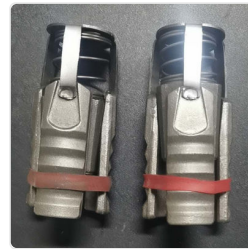
Tunnel And Mining Prestressed Expansion Shells Expansion Shell Anchor