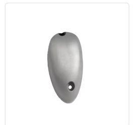
Kitchenware Parts Bathroom Hardware 304 316 Stainless Steel Parts Lost Wax Casting Parts Lost Wax Casting