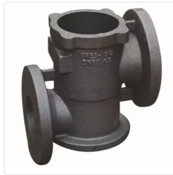
Ductile Iron Sand Casting Valve Hardware Accessories