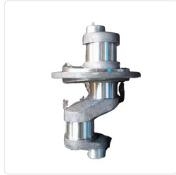
QT800-2 Ductile Iron Sand Casting Crankshafts for Auto Spare Parts