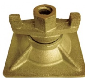
Swivel Nut with square plate