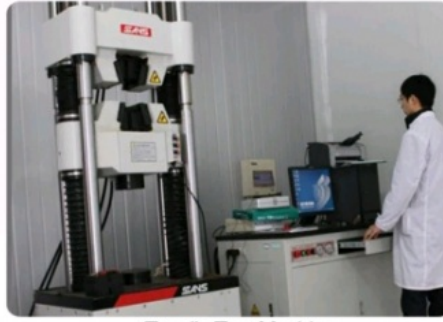
Tensile Test Machine