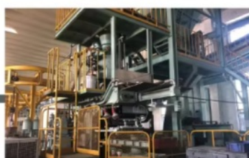
Auto Molding Line