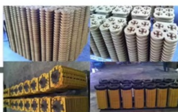
Precoated Sand Casting