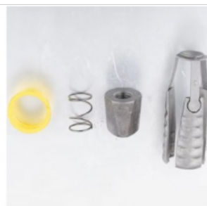
3/4 EXPANSION SHELL