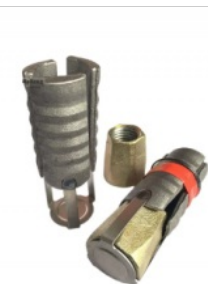
M24 EXPANSION SHELL