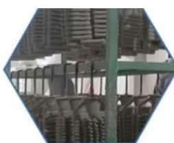
3. Shell Making