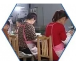
2. Wax Pattern Making