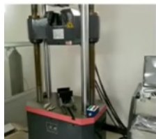
5 Tensile strength test machine