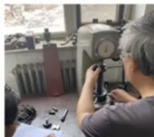
6 Hardness test