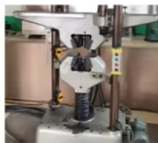
3 Strength test