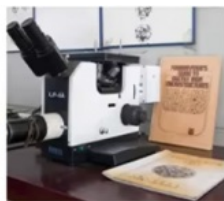
2 Metallurgical microscope