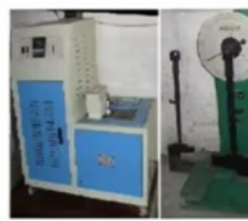
7 V Charpy Test