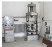
4 Tensile and Yield Strength test