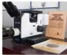
2 Metallurgical microscope