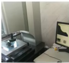
9 Profile scanning