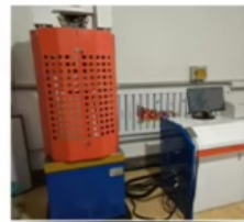
11 Magnetic particle