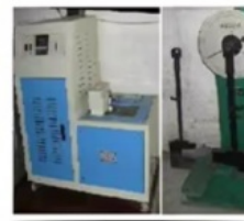
7 V Charpy Test