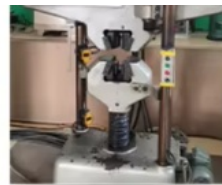
3 Strength test