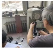
6 Hardness test