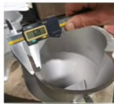
10 Dimension inspection