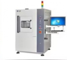
12 X Ray test