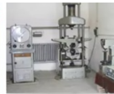
4 Tensile and Yield Strength test