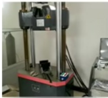
5 Tensile strength test machine