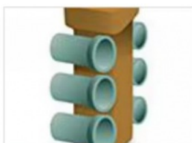
2 Tree grouping