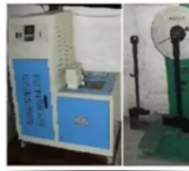
7 V Charpy Test