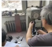
6 Hardness test