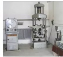
4 Tensile and Yield Strength test