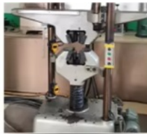
3 Strength test