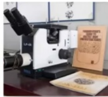
2 Metallurgical microscope