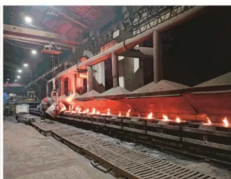
The static pressure production line