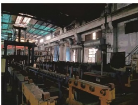
Iron mold production line