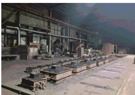
Manual pouring production line