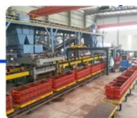
3. Auto molding line