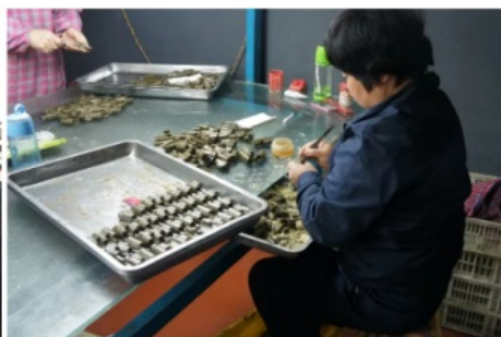
Workshop Our Workshop