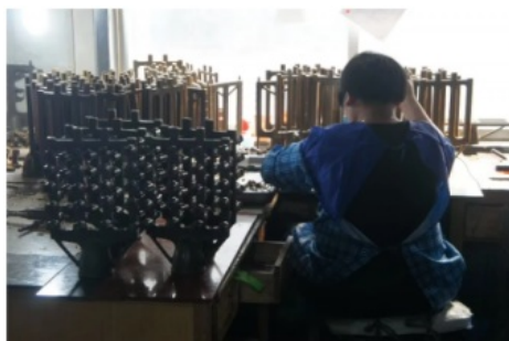
Factory Our Factory