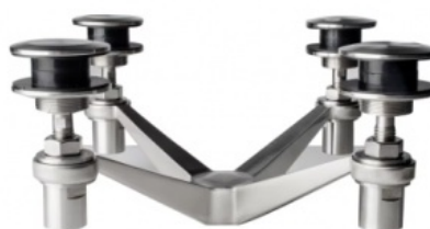
Name: Spider Fitting Material: Stainless Steel 304/ Stainless Steel 316 Process: Investment Casting Finish: Polish