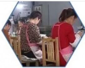
2. Wax Pattern Making