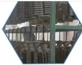
3. Shell Making