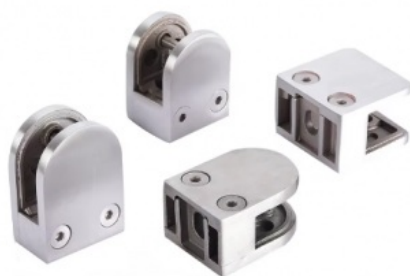
Name: Glass Clamp Material: Stainless Steel 304/ Stainless Steel 316 Process: Investment Casting Finish: Brush Polish