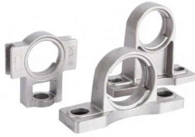
Name: Bearing Housing Material: Stainless Steel 316 Process: Investment Casting Finish: Sandblasting