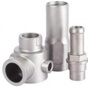
Name: Pipe Fitting Material: Stainless Steel 304 Process: Precision Casting Finish: Sandblasting