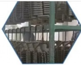
3. Shell Making