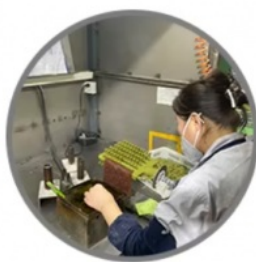
2 / Making Wax Tree >