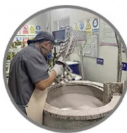
3 / Making Shell >