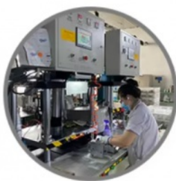
1 / Wax Injection >