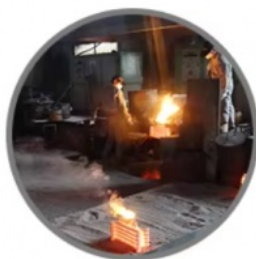
5 / Pouring >