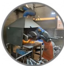
6 / Cutting >