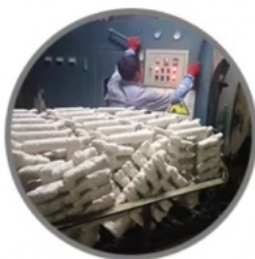
4 / Dewaxing >