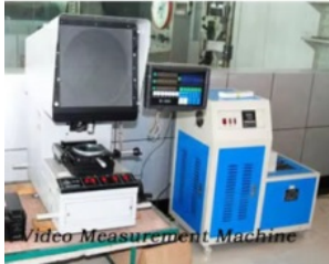
Video Measurement Machine