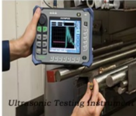
Ultrasonic Testing Instrument