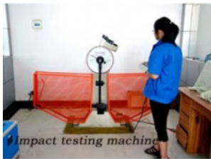
Impact testing machine