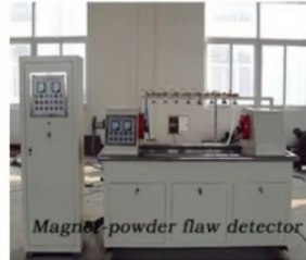
Magnet-powder flaw detector