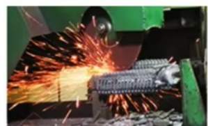
Cutting and Grinding