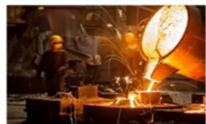
Melting and Pouring