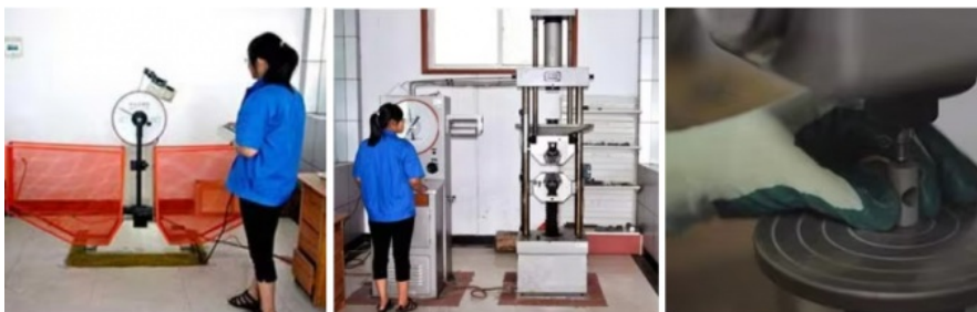
Impact testing machine

All our products would have quality control systems conforming to ISO9001:2015 quality control systems. Continuing statistical process control and process capability improvement would be applied for all products manufacturing process. Our commitment and continuous effort would be to improve product quality.