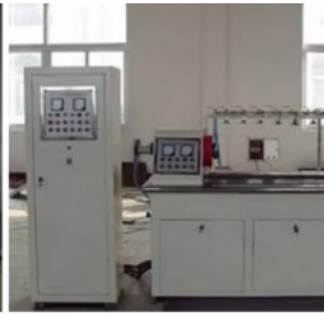
Magnet-powder flaw detector