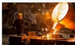
Melting and Pouring