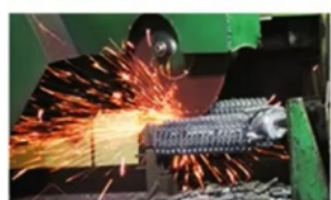
Cutting and Grinding