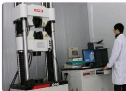
Tensile Test Machine