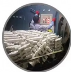
4 / Dewaxing >