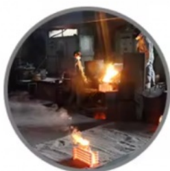
5 / Pouring >