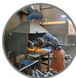
6 / Cutting >