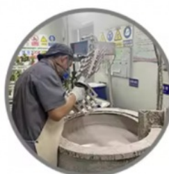
3 / Making Shell >