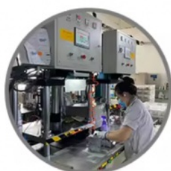
1 / Wax Injection >