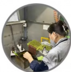
2 / Making Wax Tree >