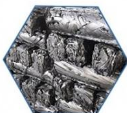
1. Raw Material