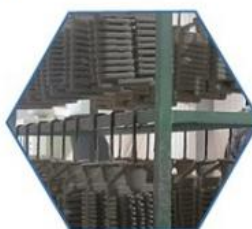
3. Shell Making