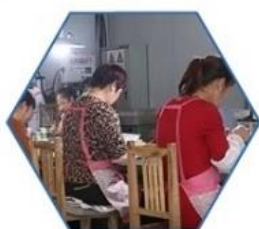
2. Wax Pattern Making