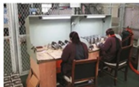
Inspection of Blank