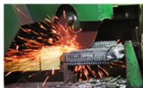
Cutting and Grinding