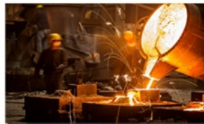
Melting and Pouring