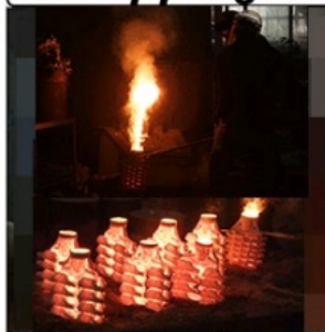
Steel Melting & Pouring