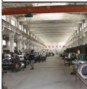
Ready For Machining