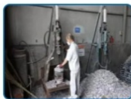
Remove the shell