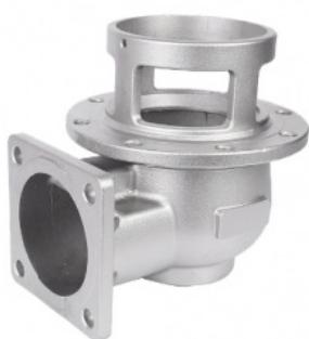
Name: Machinery Parts Material: Stainless Steel 304 Process: Precision Casting Finish: Sandblasting