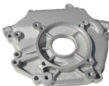
Name: Gasoline Cover Material: Stainless Steel 316 Process: Investment Casting Finish: Shot Blasting