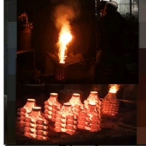
Steel Melting & Pouring