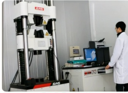
Tensile Test Machine