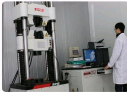
Tensile Test Machine