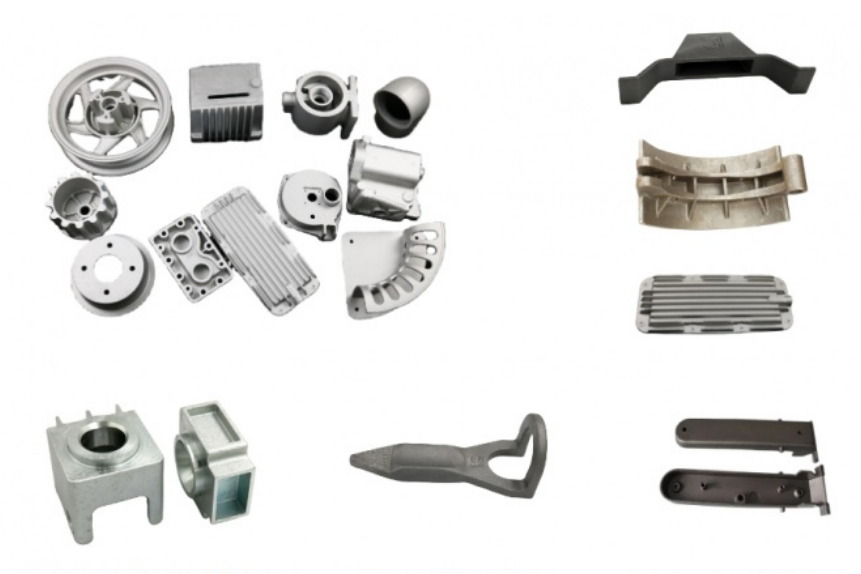
Steel Investment Casting & Machining