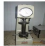
Hardness Tester -2