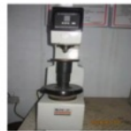
Hardness Tester -1