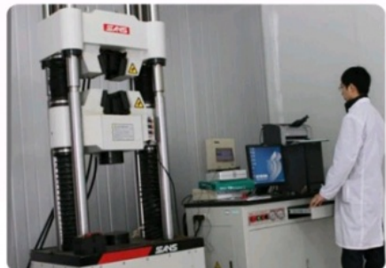
Tensile Test Machine