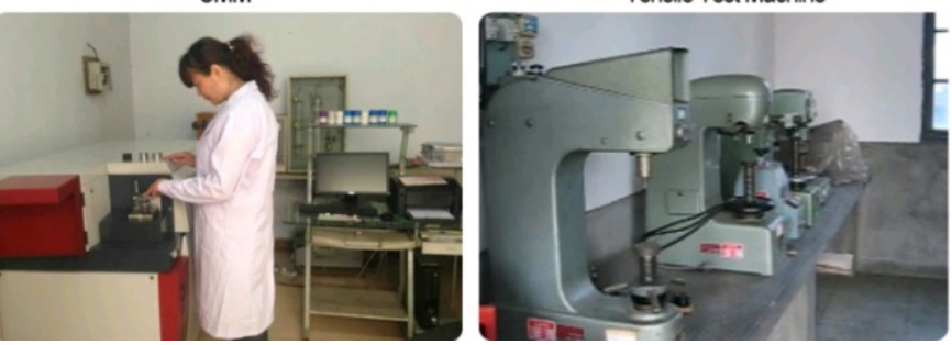
Tensile Test Machine