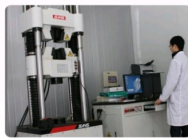
Tensile Test Machine