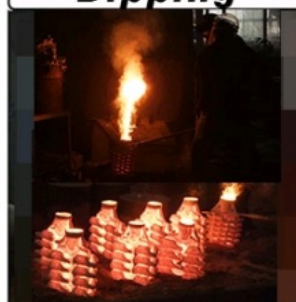
Steel Melting & Pouring