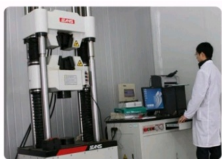
Tensile Test Machine