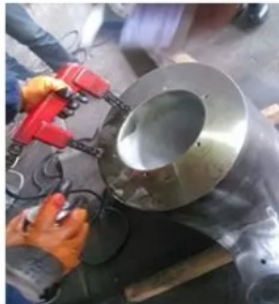
magnetic particle testing