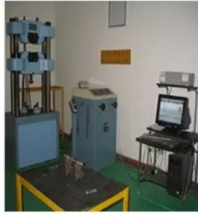
Tensile strength test