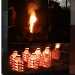
Steel Melting & Pouring