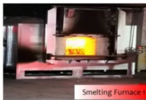
Smelting Furnace 1