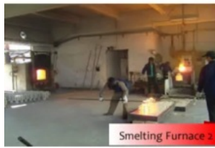
Smelting Furnace 2