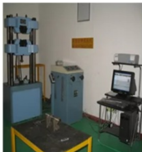
Tensile strength test