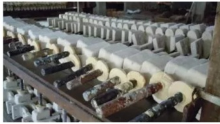
Lost Wax Casting