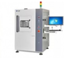
12 X Ray test