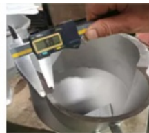
10 Dimension inspection