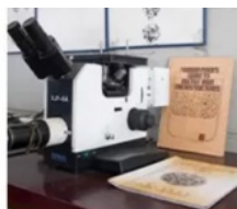
2 Metallurgical microscope