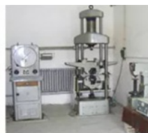
4 Tensile and Yield Strength test