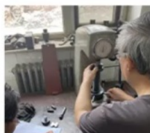
6 Hardness test