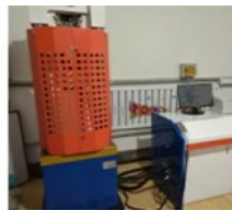
11 Magnetic particle Inspection