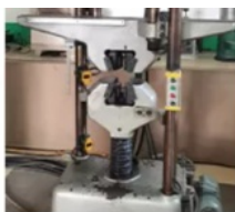
3 Strength test