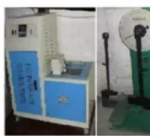
7 V Charpy Test