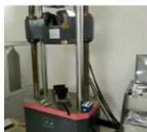
5 Tensile strength test machine