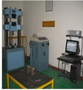
Tensile strength test