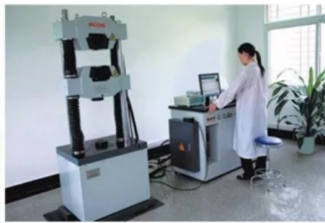
Universal Testing Machine