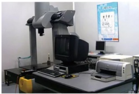
Three coordinate measuring instrument