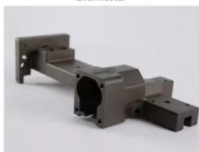
RIVET MAGAZINE CASTING