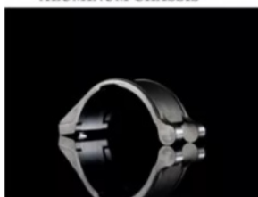
DEFENSE/CARBON STEEL LATCH