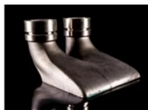
HEAVY TRUCK/COPPER CASTING