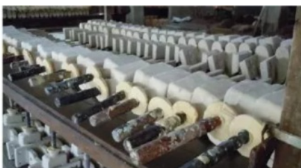
Lost Wax Casting