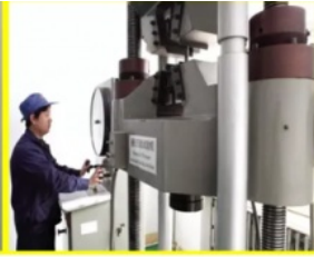
Universal Mechanical Testing Machine