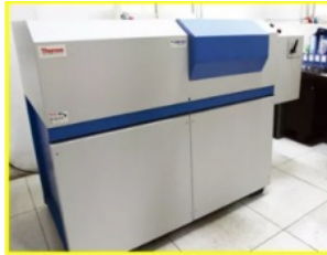
Optical Emission Spectrometer