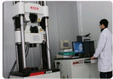
Tensile Test Machine