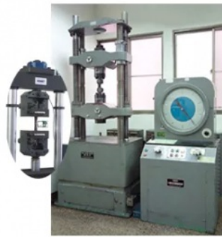
Tensile testing machine