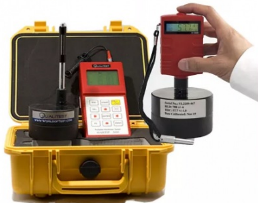
Portable Hardness Tester