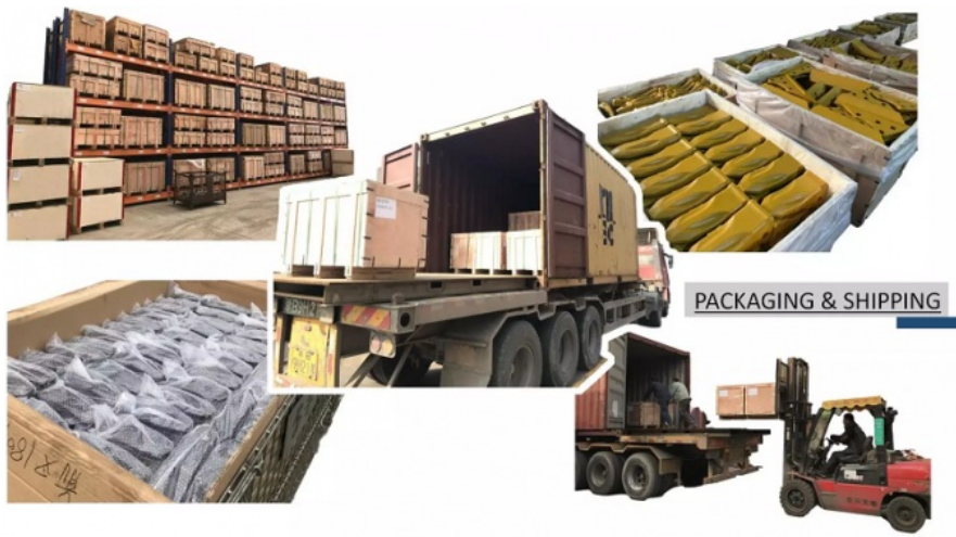
PACKAGING & SHIPPING