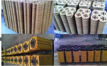
Precoated Sand Casting