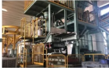
Auto Molding Line